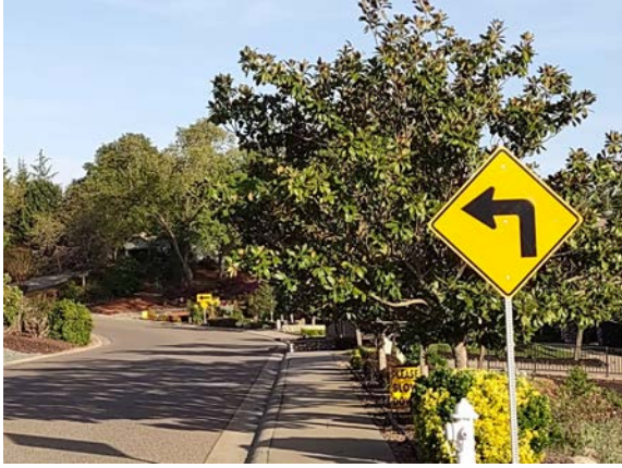
Traffic Warning Sign installed on Summer Dr in April 2023

Drive, the site of many of the car accidents.