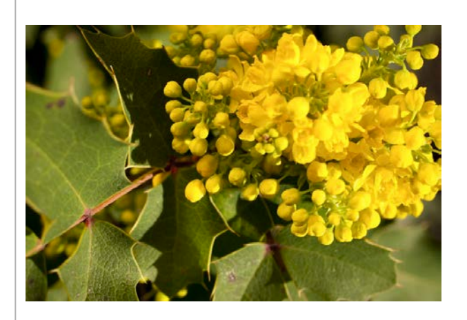
Creeping Mahonia - image credit: Gardenia.net

With a little planning and effort, you can create a thriving and beautiful landscape using native groundcovers here in the Bass Lake area.