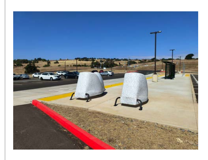
Bass Lake Rd Park & Ride Bike Storage Pods

For more information on the Bass Lake Park-and-Ride Lot or El Dorado Transit services and schedules, visit eldoradotransit.com.