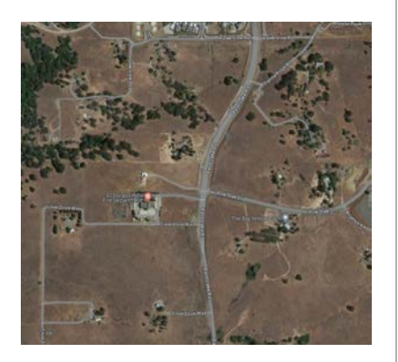
Silver Dove Bike Park Site

Trails include: Jump feature Berm Turn feature Roller feature Log Ride feature Rock feature Skills Station