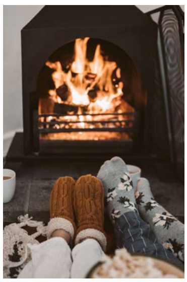
(Continued on page 7)

Regular chimney cleaning is paramount for maintaining fireplace safety. Over time, the burning of wood or gas in the fireplace can cause the accumulation of soot and creosote, a highly flammable substance, on the chimney's interior surfaces.