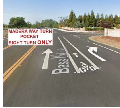
Northbound Bass Lake Rd Madera Way Turn Pocket

The Bass Lake Action Committee has suggested that paint on the Madera Way right turn pocket lane, effectively closing the lane, along with RIGHT TURN ONLY signage might improve the safety at the intersection. It would still be possible that motorists would continue to drive through the right turn pocket, since they seem to be ignoring the stop signs at Bass Lake Road-Silver Springs Parkway, but area residents are looking for any sort of safety improvement.