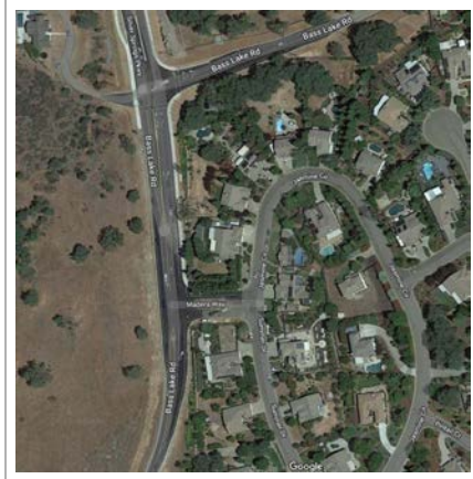
Bass Lake Rd: Madera Way and Silver Springs Pkwy intersections

onto either south or northbound Bass Lake Road continue to report near collisions.