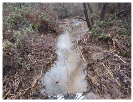
Green Springs Creek

Even Green Springs Creek, which runs between Tea Rose Drive and Watsonia Glen Drive in The Hills of El Dorado Village mostly a slow-moving stream in a standard storm, filled to its brim several times during the storms – finally ebbing and passing under Bass Lake Road as seen here on Monday January 15th.