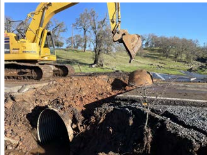
Latrobe Road Under Repair

You may be inconvenienced by the closure. You may disagree with the closure. But please don't take or move the signage & barricades or drive around them. We have them closed for your safety!