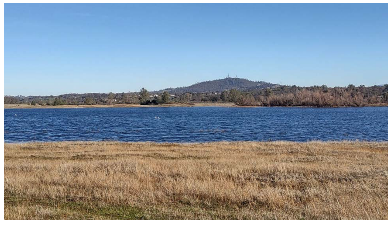
Bass Lake filling up - January 22, 2023