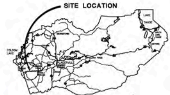
VICINITY MAP COUNTY OF EL DORADO