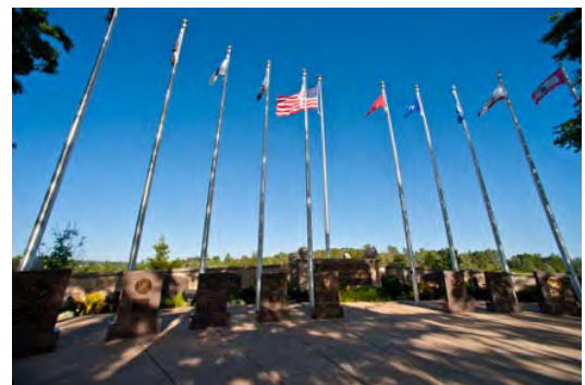
El Dorado County Veterans Monument