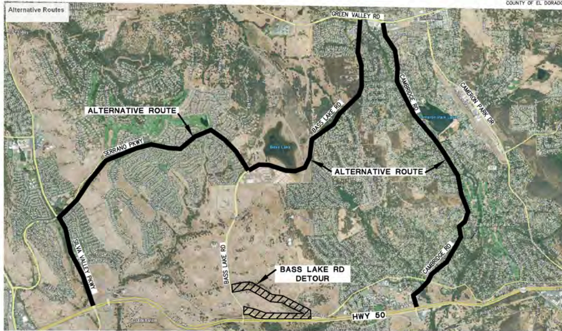
BASS LAKE ROAD CONSTRUCTION DETOUR & ALTERNATE ROUTES MAP