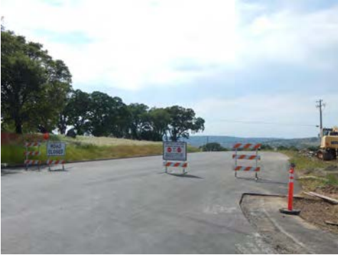
New Country Club Drive intersection with Tierra de Dios Drive.

Portable changeable electronic messages signs have been positioned along Bass Lake Road and Country Club Drive, and will remain until the project is completed, to advise drivers of changing conditions, safety information, and delays.