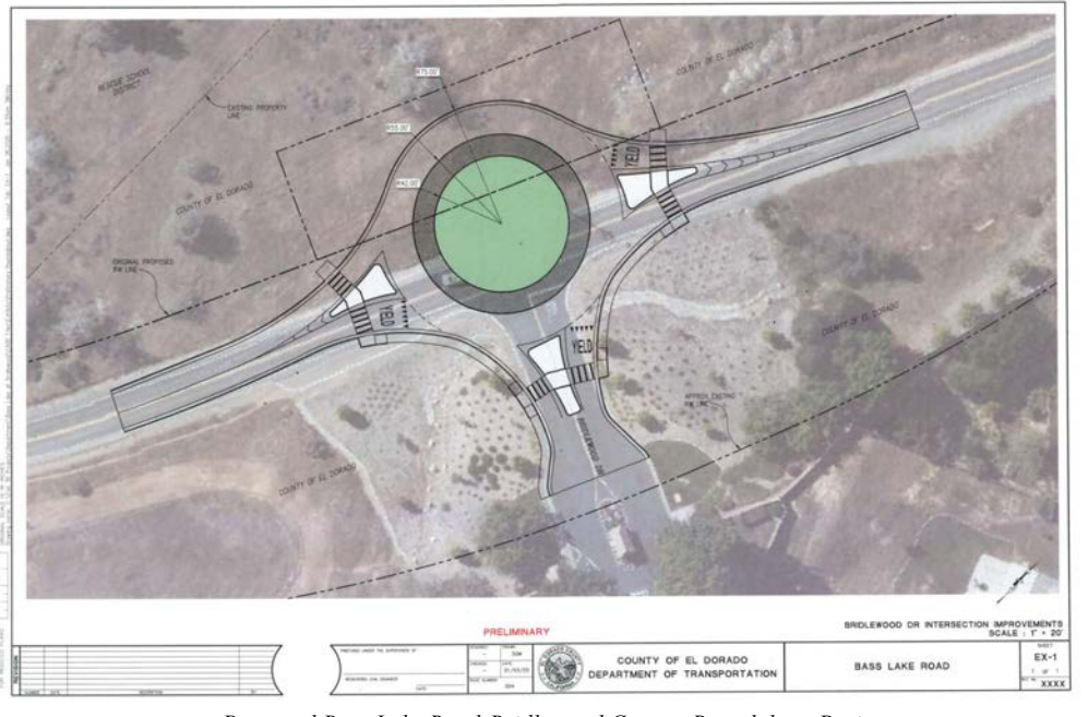
Proposed Bass Lake Road-Bridlewood Canyon Roundabout Project Click the image for a larger version