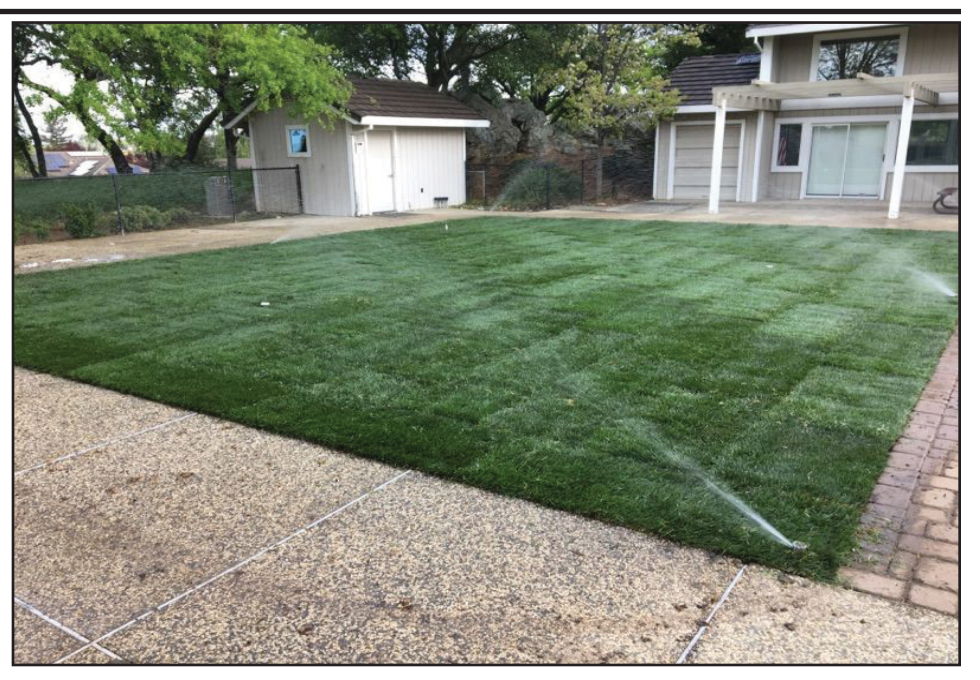
New sod lawn at Oak Knoll Park

The CSD has already entered into an agreement to purchase the EID maintenance yard property below the Bass Lake dam and adjacent to the Bass Lake property. ~