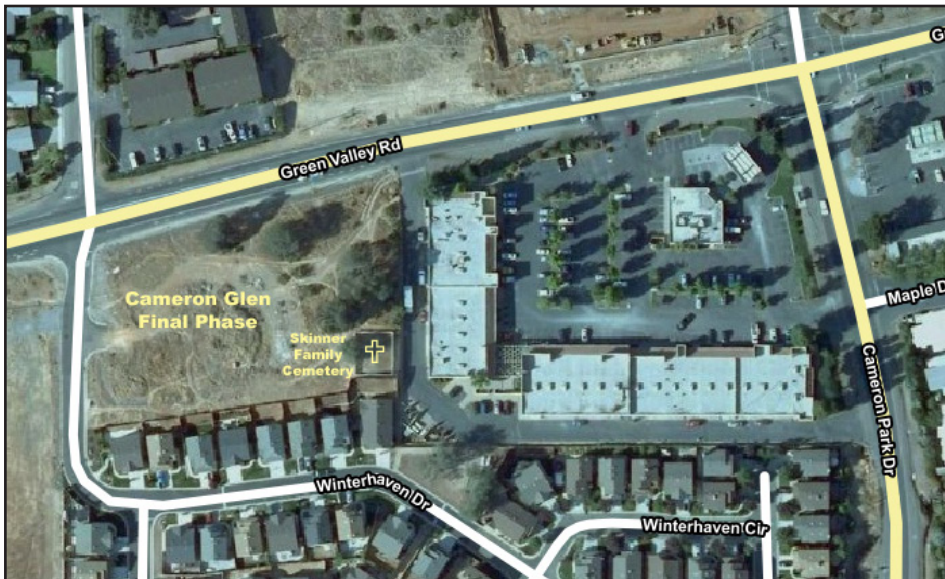
Map showing the locations of the development and the Skinner Pioneer Family Cemetery