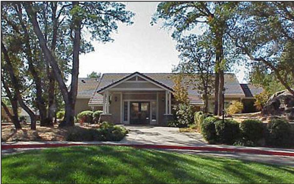
Oak Knoll Park and Clubhouse in the Hills of El Dorado