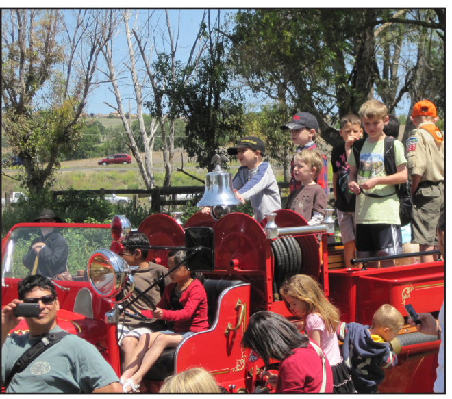
The Rescue Antique fire engine was a big attraction, especially for children, at Clarksville Day