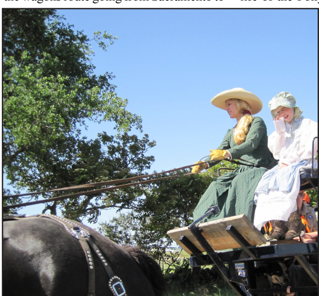
Members of Boy Scout Troop 465 enjoy a wagon ride before taking up their duties as volunteers at Clarksville Day.

Clarksville Day 2012, presented by the Clarksville Region Historical Society, was bigger than ever this year, with an estimated 4,000 visitors thronging the old ghost town of Clarksville on June 5th. Readers will recall that Clarksville was the original settlement along Carson Creek that served the wagons route going from Sacramento to