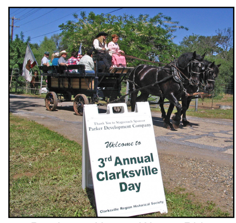
Percheron Horses Wagon Ride

It appears that the CSD Board and staff will study the issue and make a decision about what to do with the under-funded LLADs in the near future. \sim