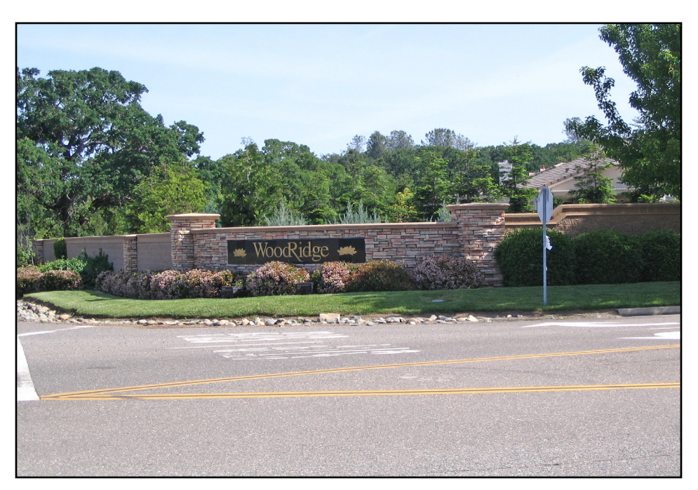
Bass Lake Village Woodridge Zone B landscaped entry at Madera Way