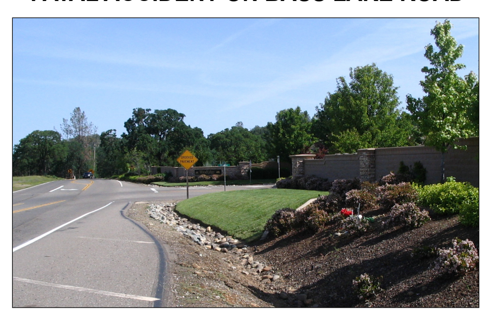
Ditch and memorial near Madera Way where body of motorcyclist was found

A Cameron Park man died on the morning of April 27 in a motorcycle crash on the east side of Bass Lake Road near Madera Way.